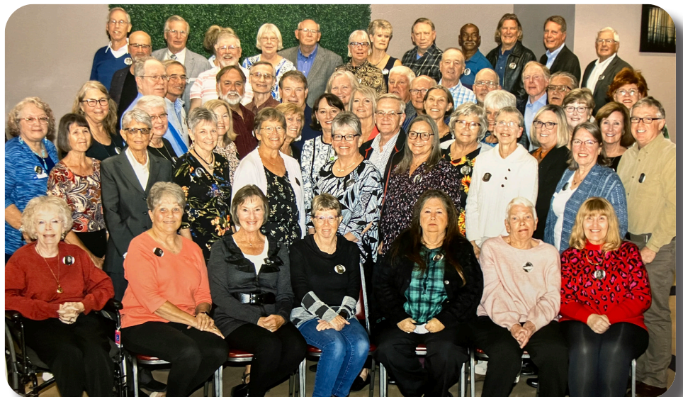
Members in attendance at the KHS Class of 1972 50th Reunion